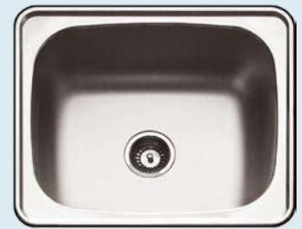
DROP IN BASIN